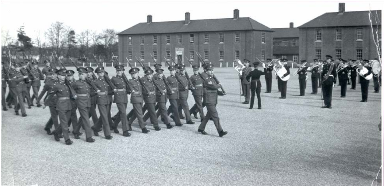
Passing out parade April 1956