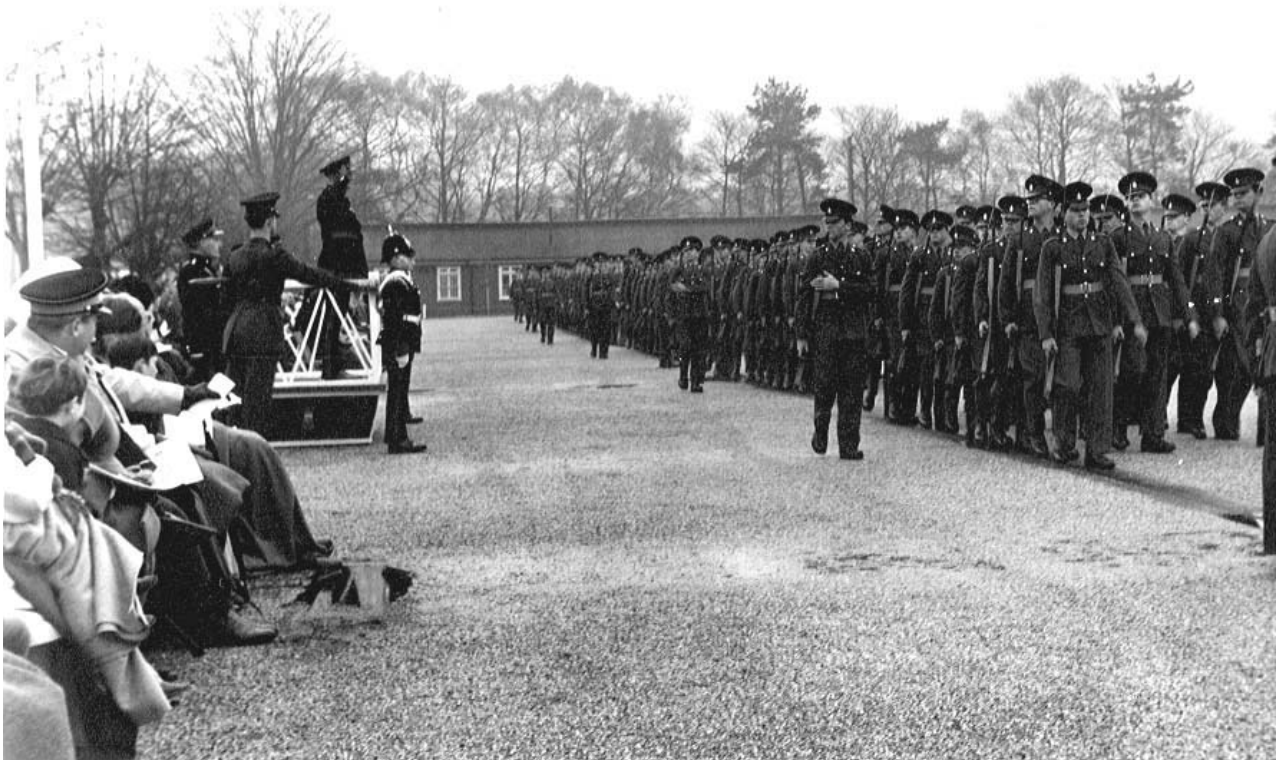
Passing out parade April 1966.