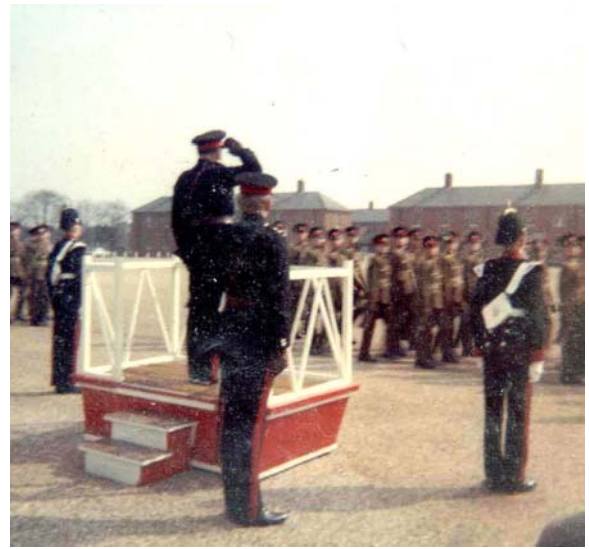
Inspecting Officer taking the