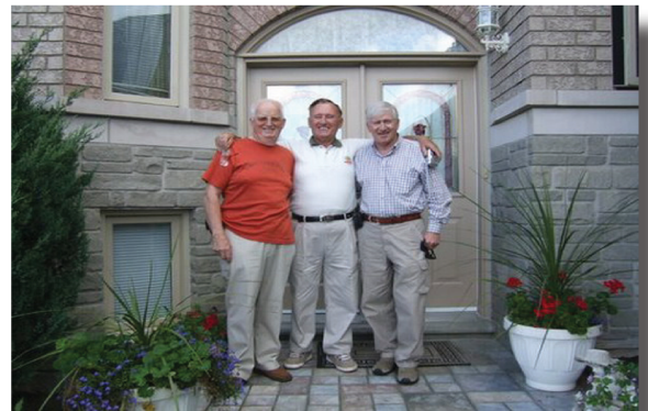
Reunion in Canada