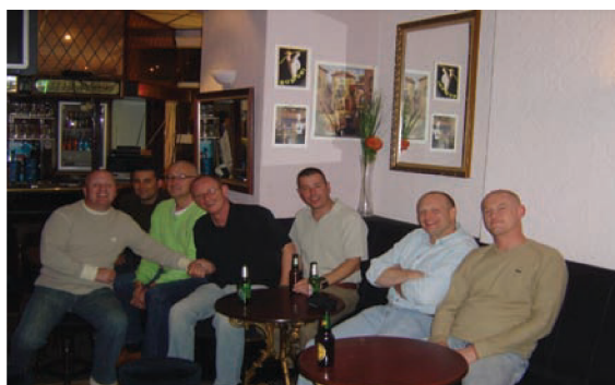
1983-84 Ardennes Platoon Reunion

Remember if you have any photos please email them to: