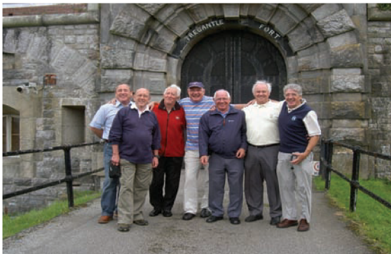
Nostalgic visit to Tregantle Fort

Here are a few photos from some of our "mini reunions" last year!