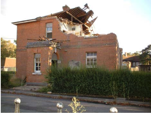
Demolition of ALMA BARRACKS