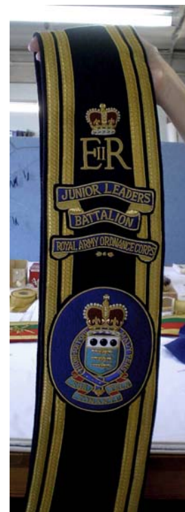
Junior Leaders Drum Majors Sash