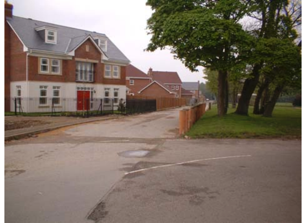
Residential development of Dettingen Barracks