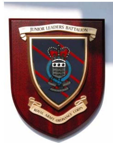
Shields available @ cost + P&P