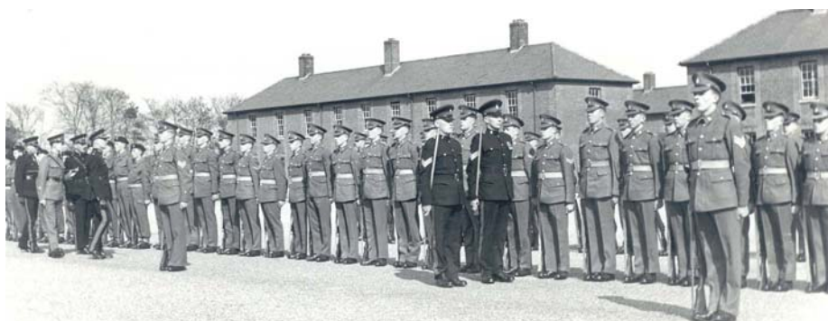
PASSING OUT PARADE INSPECTING OFFICER CIRCA 1956/57