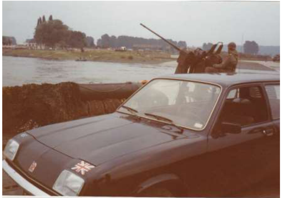
Bundeswehr river ro-ro ferry On the River Rhine near Wesel