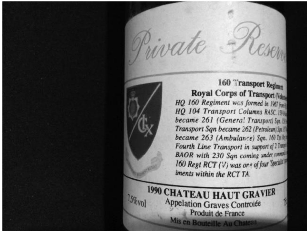
Figure 41. Regimental Wine commemorating 160 Tpt Regt RCT(V) and its predecessors