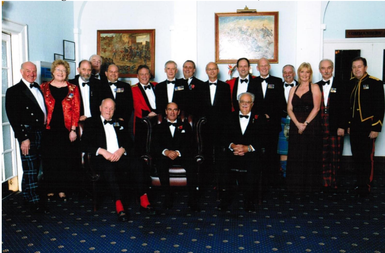
Figure 37. 02 Nov 2013 Disbandment Dinner, Team of 1985-88