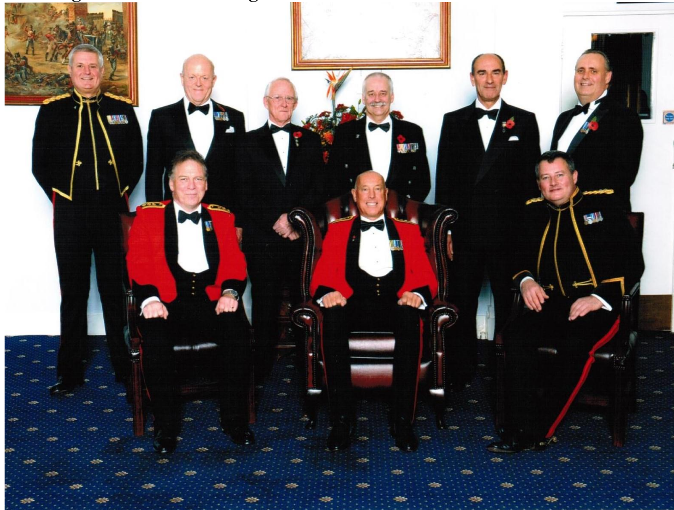
160 Transport Regiment Disbandment Dinner 2 November 2013 Former Commanding Officers