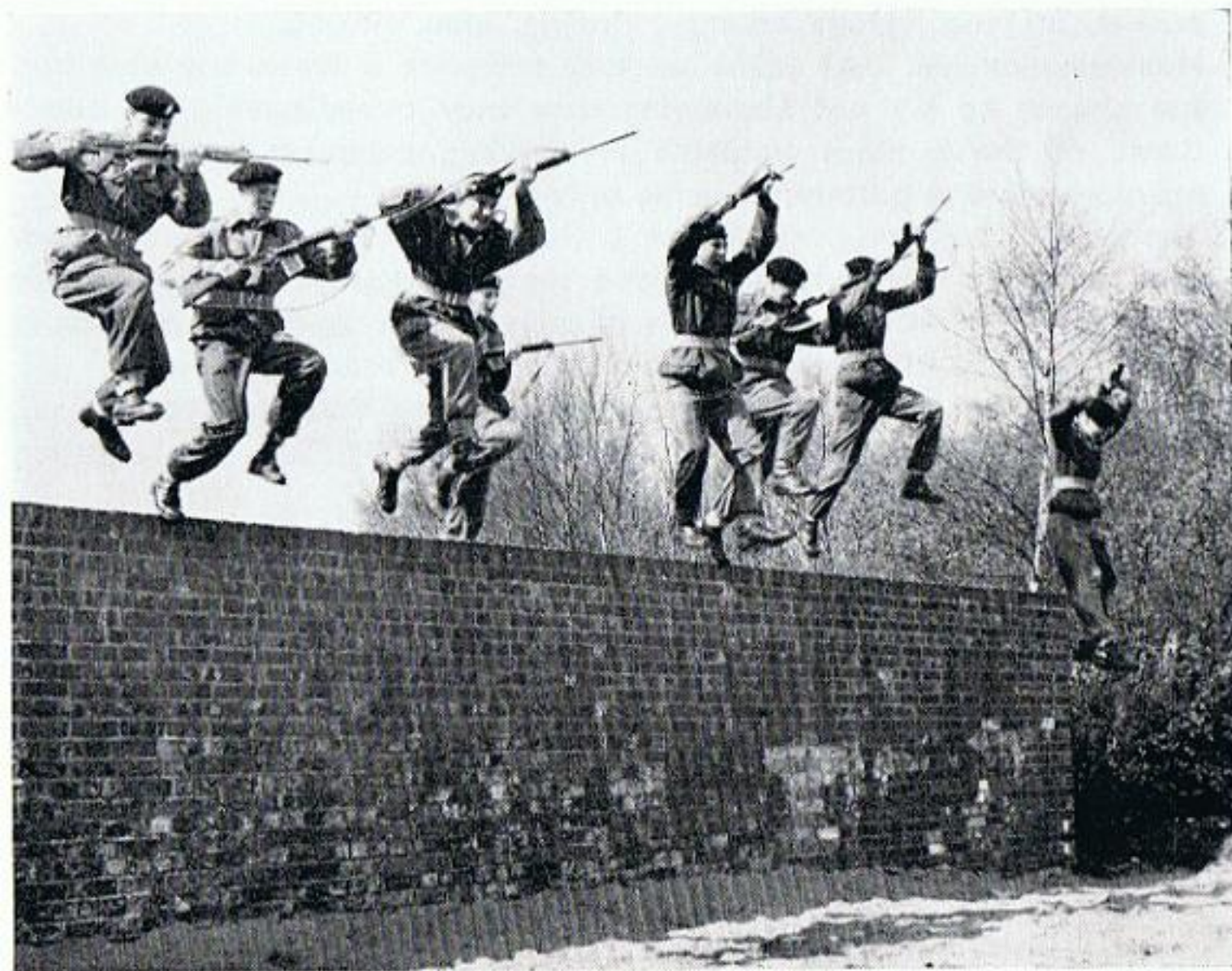
R.A.O.C. Apprentices cross an obstacle on the Assault Course.

Perhaps you are too young to join the Army as an adult? If you are between the ages of 15 and 17 you can still join the Royal Army Ordnance Corps by becoming a junior soldier. Many young men who come into the Army by this scheme rise to high ranks. In all Apprentices' Colleges great emphasis is placed upon developing leadership qualities, with the result that the majority of juniors enter upon their adult service with a flying start and already holding trade and educational qualifications.