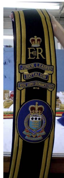
Junior Leaders Drum Majors Sash