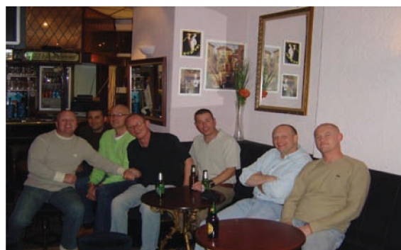
1983-84 Ardennes Platoon Reunion

Remember if you have any photos please email them to: